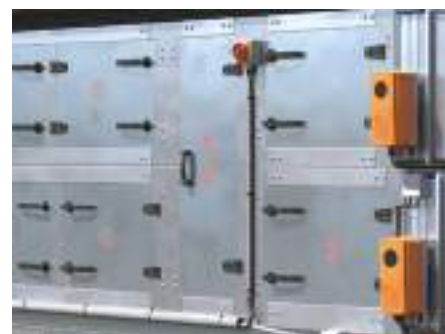
AIR HANDLER DAMPER ACTUATORS 2.5...160 Nm

If any of the above cannot be met – retrofit the damper with properly sized actuator and linkage solutions. The Belimo Retrofit App is a quick and simple tool for accurately selecting valves, actuators, sensors and replacement solutions. Belimo offers a full range of damper actuators and sensors along with standard or custom linkages. With a wide variety of control signals and torque ranges, we can ensure your control dampers will operate with maximum reliability and high performance.