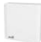
22RTM-19-1 CO 2 room sensor