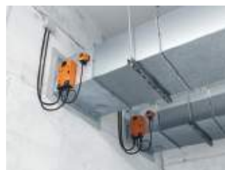
FIRE DAMPER ACTUATORS 2...18 Nm