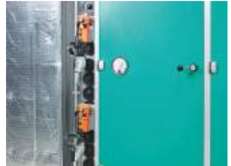
Damper actuators on air handling unit

Belimo offers a wide range of sensors to measure CO 2 levels in the room and ventilation ducts as well as high quality actuators to replace faulty components in ventilation systems.