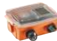
22ADP-184B Differential pressure sensor for filter monitoring