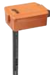
22DC-11 CO 2 sensor