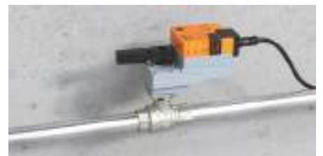
CHARACTERISED CONTROL VALVES AND GLOBE VALVES