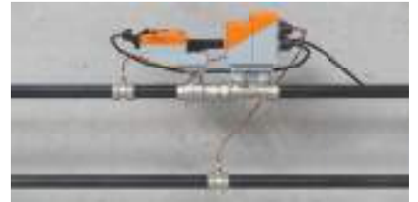
BELIMO ENERGY VALVE™

If a replacement is needed, Belimo offers a full range of valves, actuators and pipe sensors to meet your needs. If you need technical expertise, please contact your local Belimo representative.